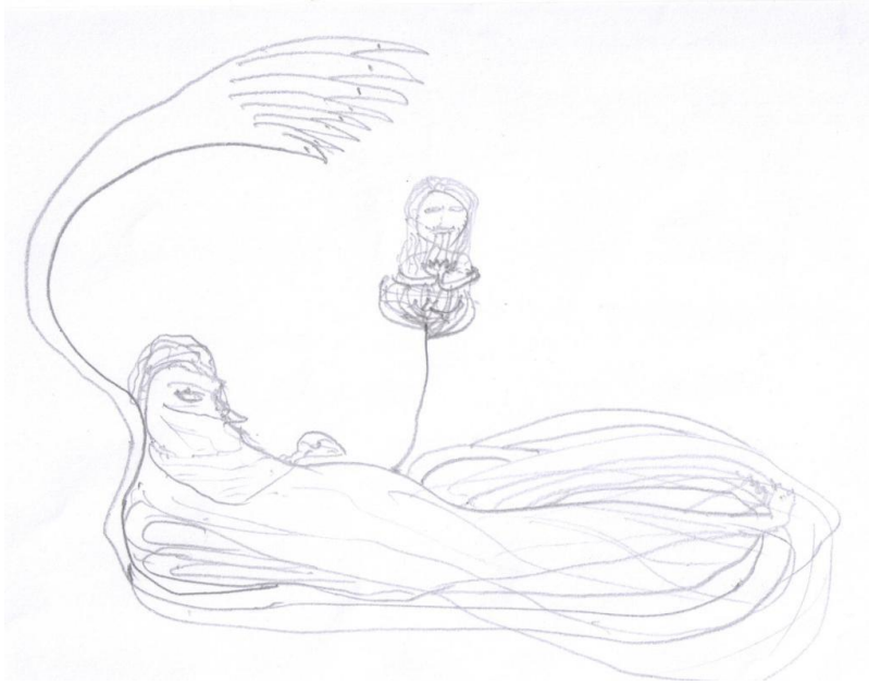
only indicative image (केवल संकेतात्मक चित्र)

The navel is called the center. Various new and old ideas are revealed with the attention/meditation on Kundalini. The idle thoughts of them become quiet. From this, beneficial thoughts become powerful and become resolutions. Similarly, Lord Brahma (sankalpa-rupa/resolution-form) is said to have arisen from the navel of Lord Narayana. When I was busy with creative work, I used to get a lot of support from my Kundalini. Thus it is proved that the Puranas/ancient spiritual mythology have explained the origin of Brahma from the navel of Lord Vishnu to explain the creation of humane resolutions from Kundalini. This happens in both cases as true, because everything that is happening in our body is happening in the same way in the universe.